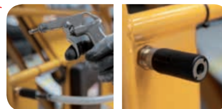
Air line in platform