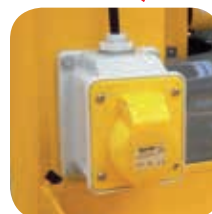
Electrical connection point