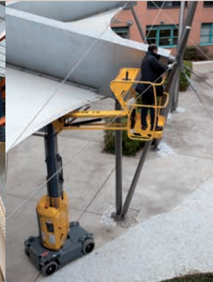
EVENTS (trade shows, television studio sets, concerts, etc.)