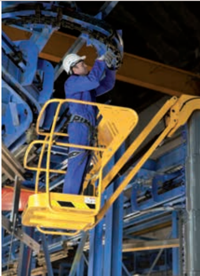
MAINTENANCE AND INDUSTRIAL CLEANING