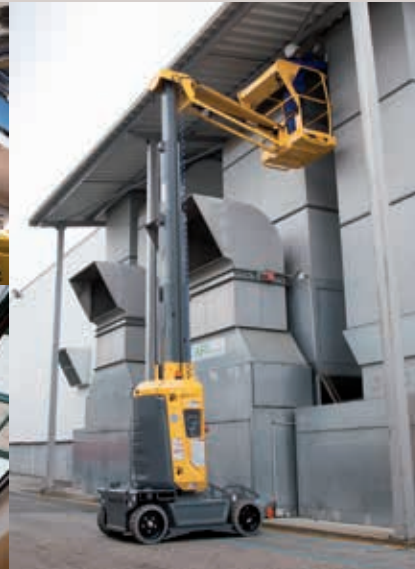
MAINTENANCE AND OUTSIDE INFRASTRUCTURE CHANGES (lighting, signage, repairs, etc.)