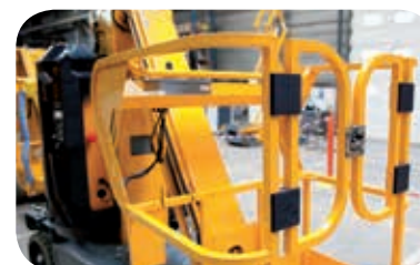
Swing gate entry