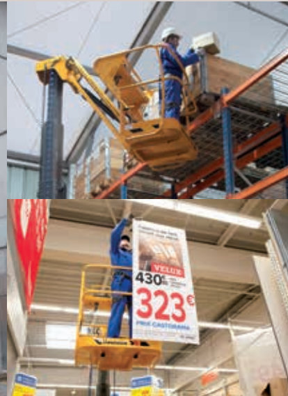
LOGISTICS AND DISTRIBUTION (stock picking, warehousing, inventories, decorations, etc.)